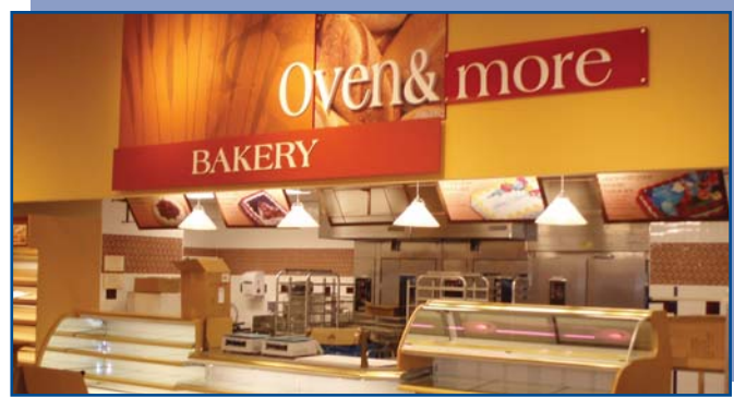
The Giant Foods Store, Urbana, MD

A fast-track project completed in less than 90 days, including site work.