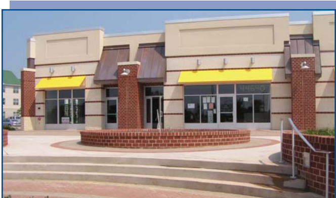
Ashburn Restaurant Complex, Ashburn, VA

This 57,000sf anchor store for a major retail site includes a bank, bakery, pharmacy and cafe.