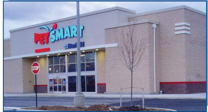
Chambersburg Crossing, Chambersburg, PA

One of five retail projects completed for U.A. in the past 18 months. Other locations include Virginia, Pennsylvania and Delaware.