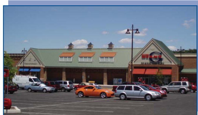
The Villages of Urbana, Urbana, MD

A complete site package and construction of six shell buildings for a variety of franchises, including Five Guys Restaurants, Daily Grind & Pizzeria Alforno.