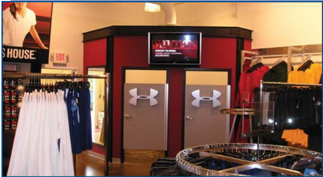
Under Armour, Baltimore, MD

From Chambersburg, PA to Leesburg, VA, retailers are discovering the value of partnering with Morgan-Keller. While the projects vary in size, location and use, they have all benefited from Morgan-Keller's experience and focus on timely delivery of quality construction services.