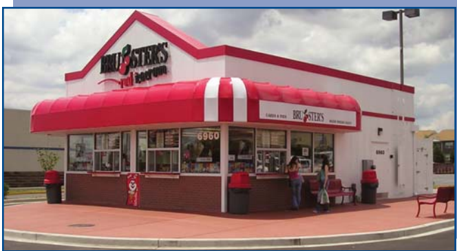
Brusters Ice Cream Parlor, Frederick, MD

A 46-acre site project accommodating over 300,000sf of retail space; includes stores for PetSmart and Michaels, both built by M-K.